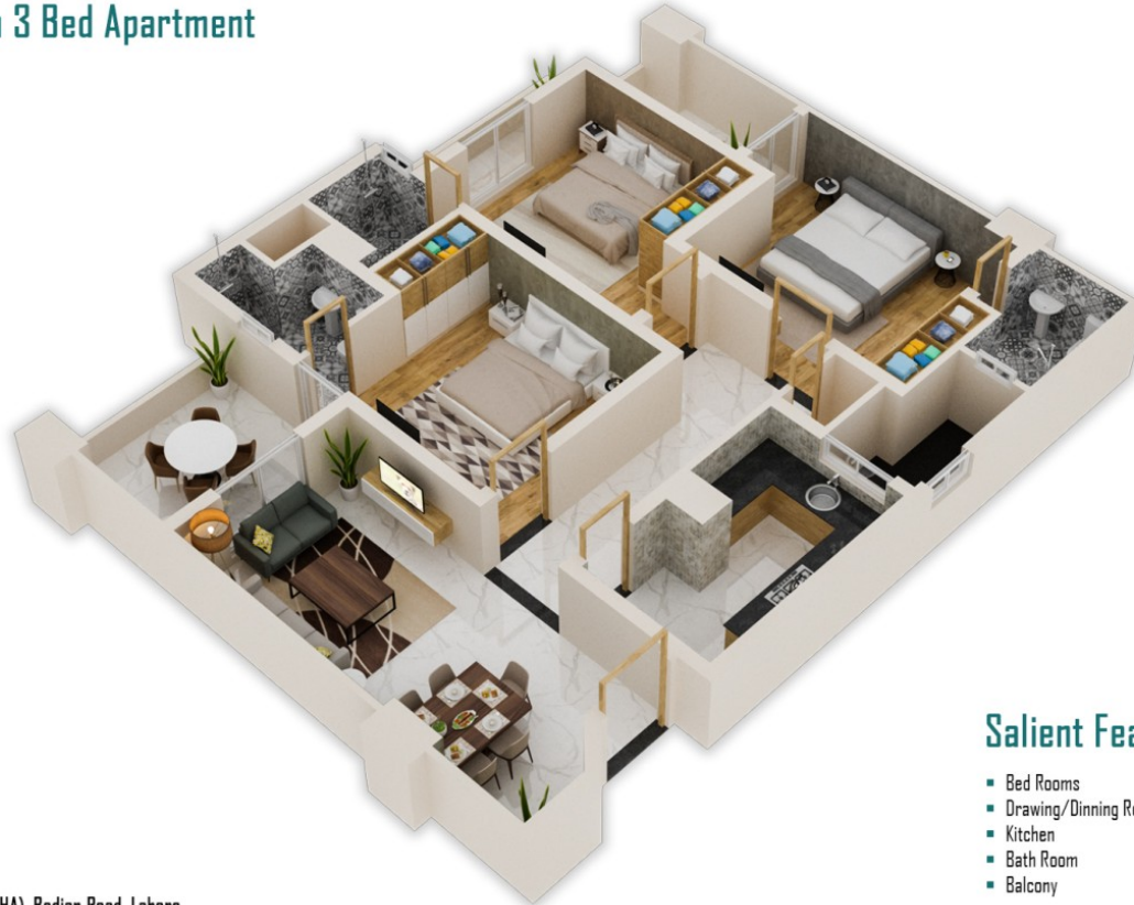
Layout Plan 3 Bed Apartment (1875 SFT )