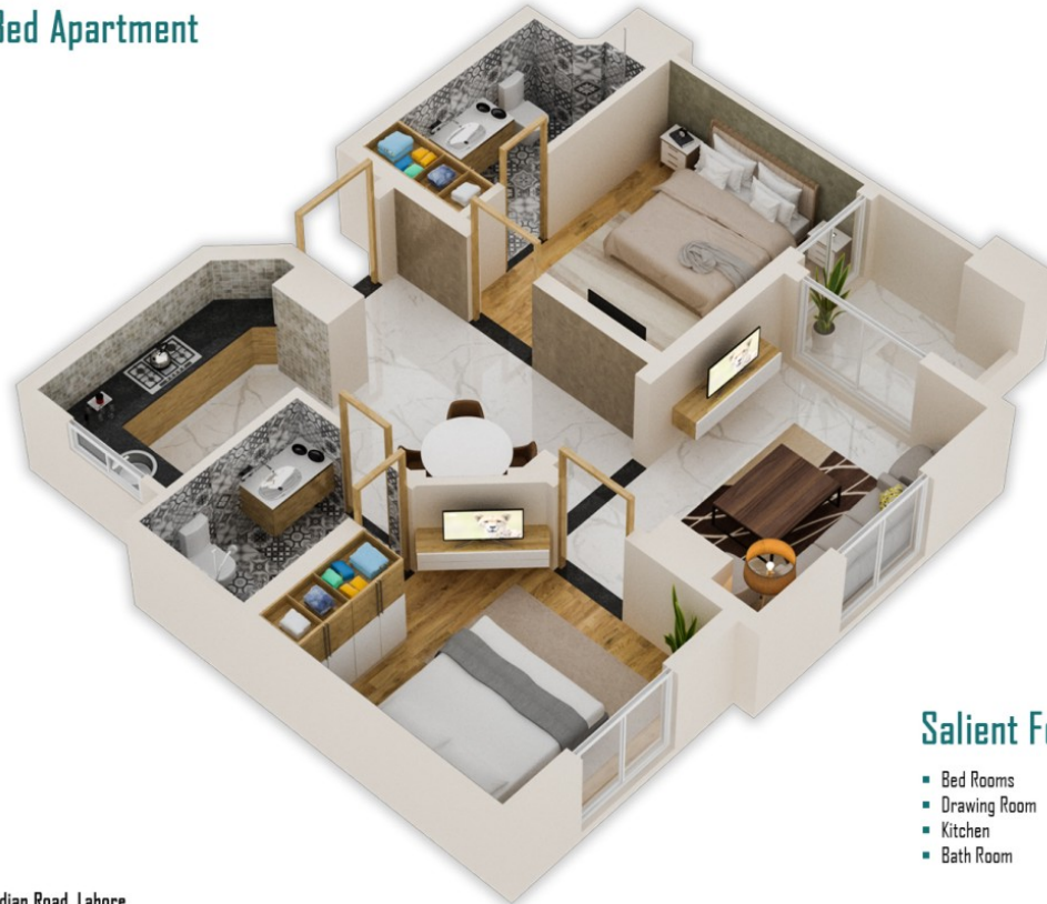
Layout Plan 2 Bed Apartment (1150 SFT)