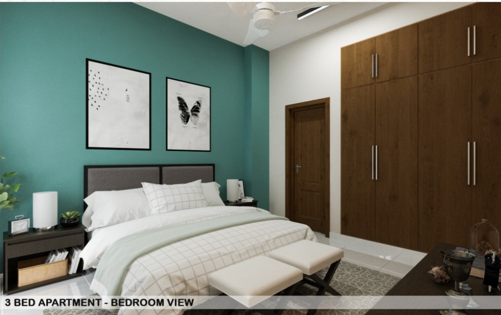
3 BED APARTMENT - BEDROOM VIEW