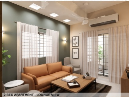
2 BED APARTMENT - LOUNGE VIEW