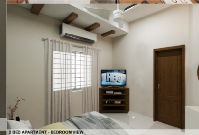
2 BED APARTMENT - BEDROOM VIEW