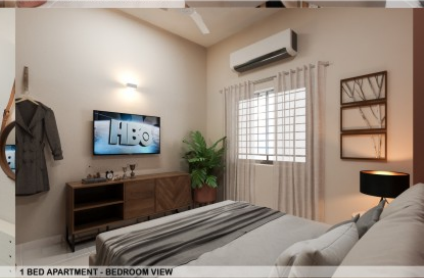
1 BED APARTMENT - BEDROOM VIEW