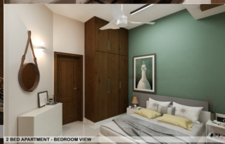
2 BED APARTMENT - BEDROOM VIEW