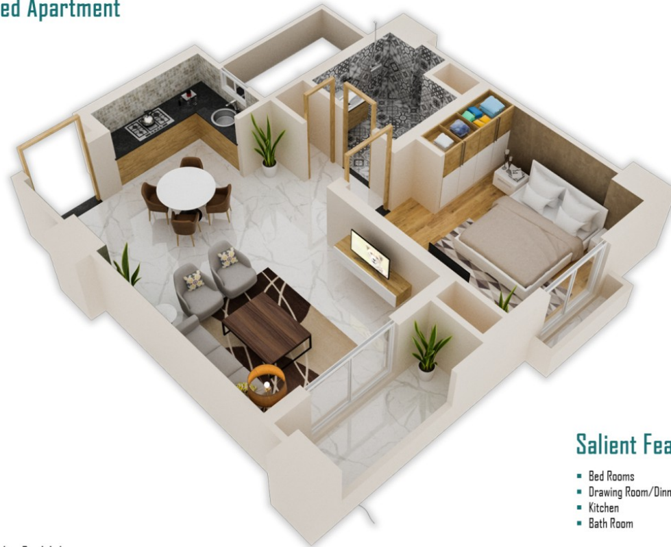
Layout Plan 1 Bed Apartment (880 SFT)