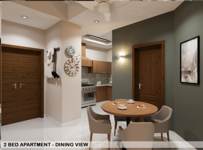
2 BED APARTMENT - DINING VIEW