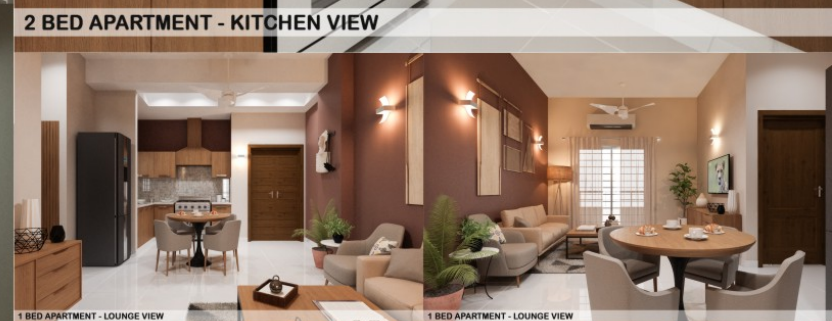
1 BED APARTMENT - LOUNGE VIEW