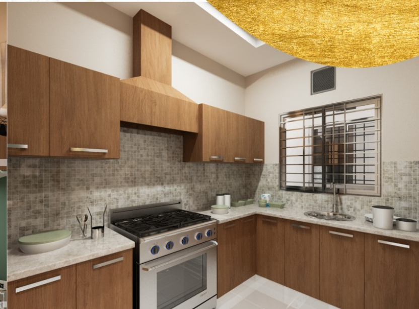
2 BED APARTMENT - KITCHEN VIEW